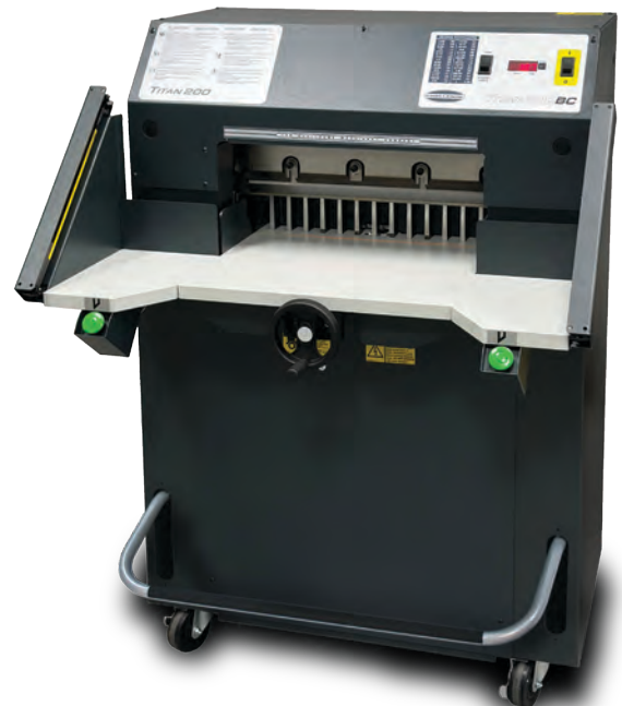
(shown with foot pedal option)