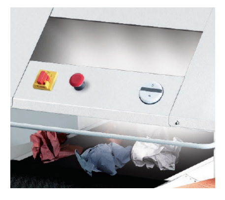
ILLUMINATION OF THE WORKING AREA

The conveyor belt system guarantees a high work speed without creating paper jams. Also crumpled paper can be fed into the shredding head without problems.