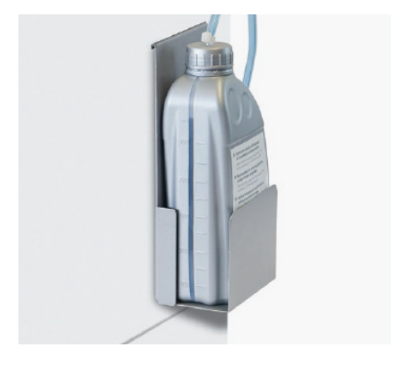
ELECTRONIC OIL INJECTION

Ease of operation: intelligent multifunction switch with integrated optical signals indicating the operational status.