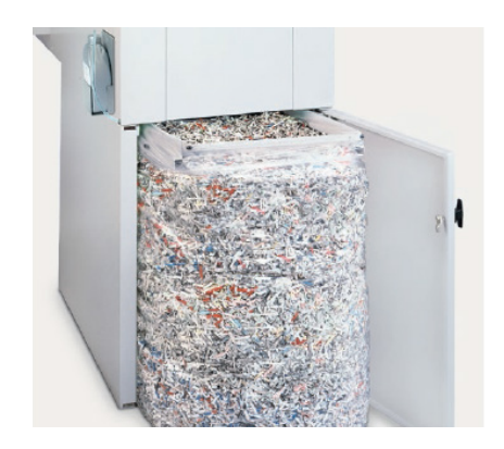
PULL-OUT BAG SUSPENSION

The automatic oil injection system lubricates the cutting shafts when shredding and guarantees a constantly high shred performance.