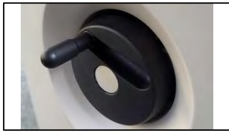
Easy format set-up with simple hand wheel activating all side lay gauges