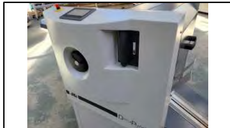
New front casing with modern design