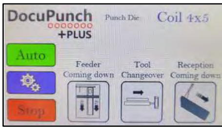
New easier-to-use colour touch screen interface