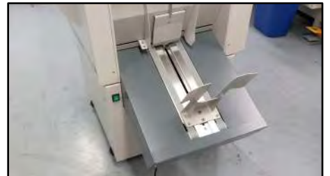
Reception with capacity up to 250mm (5 reams ~ 2 500 sheets)