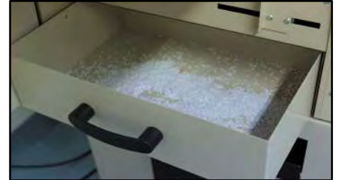
Large capacity waste bin