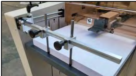
New feeder with improved settings and more robust design. Capacity up to 250mm (5 reams ~ 2 500 sheets)