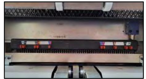
Wide range of quality 14" punch dies with retractable pins and backward compatibility with the previous range of dies