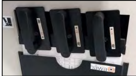
Storage space for 3 dies