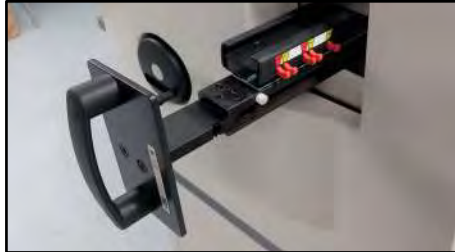
Easy tool change in less than 2 minutes