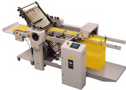
BAUM 20 PFF

The Baum 20 PFF & CFF Models contain many new and unique features that were not found on the previous generation of Baum 20 Floor Model Folders.