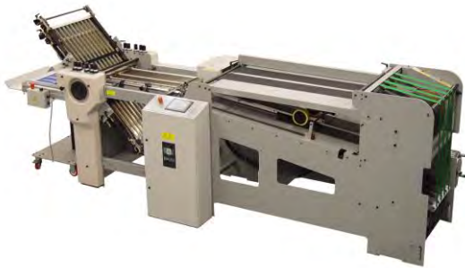
BAUM 20 CFF

We have retained the same proven features of the previous model including: