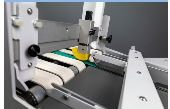
Flex Belt™ Technology