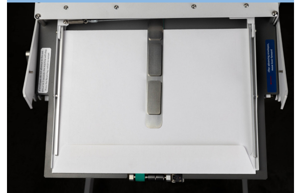
Flexible, runs full 13" wide media portrait or landscape