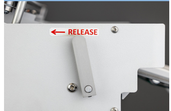
Secure Latch™ alignment system