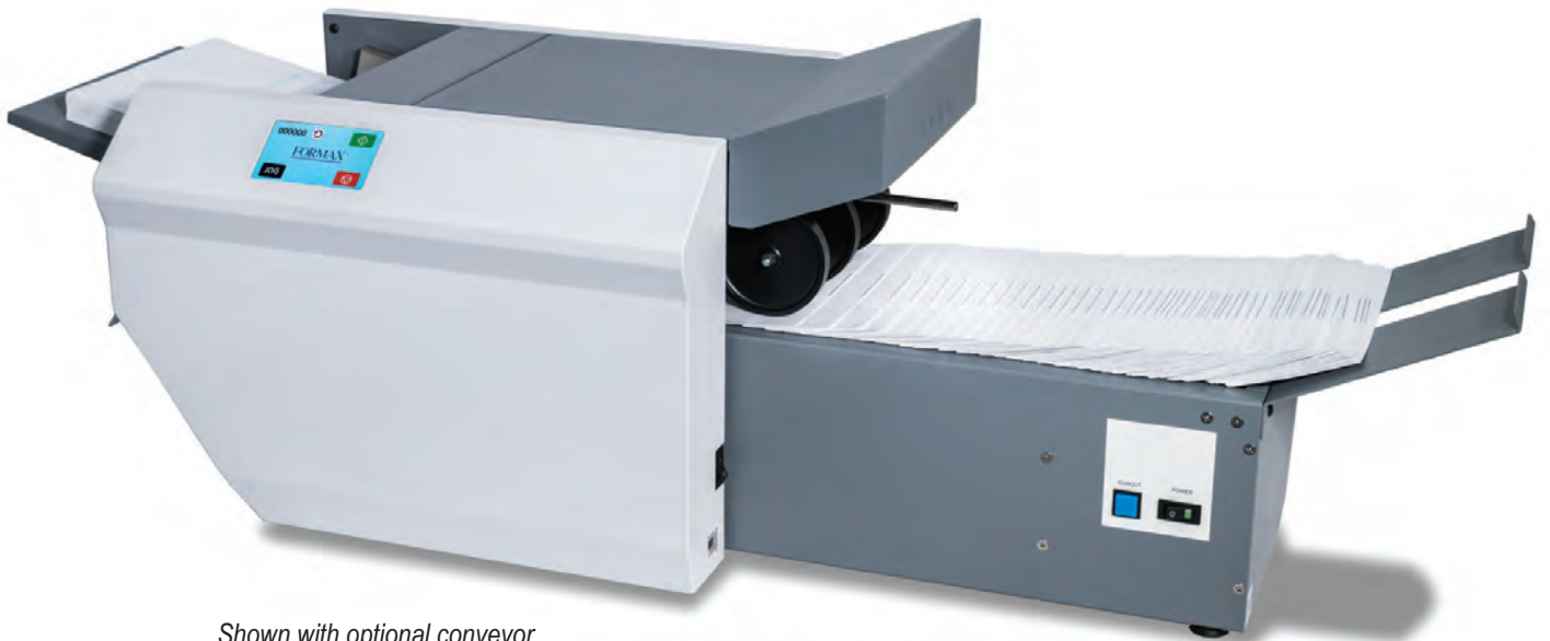
Shown with optional conveyor