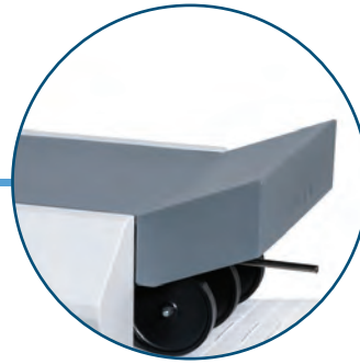
Insulated Fold Plates Top, side covers, and fold plates are insulated to reduce noise