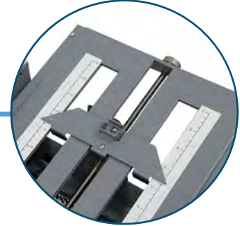
Easy to Adjust Fold Plates Clearly marked and easy to adjust for popular and custom folds