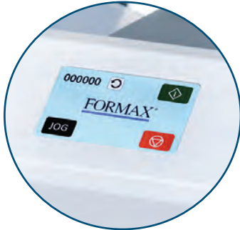
Color Touchscreen Control Panel Graphics-based and designed for easy, walk-up use

The FD 2036 AutoSeal® offers speeds of up to 11,000 forms per hour and the ability to process forms up to 14” long. Standard features include a color touchscreen control panel , insulated fold plates to reduce noise , and a drop-in top feed system , all in a compact and sleek desktop design. Fold plates are pre-marked for standard folds for 11” and 14” form sizes, and can be easily adjusted for custom folds. Fold types include Z, C, Uneven Z and C, Half and custom folds. Pressure seal mailers can be used for virtually any application that can be printed on one form, including checks, invoices, school reports, tax forms and appointment notices. Proudly made in the USA , the FD 2036 is built with proven Formax technology, and the durability to last.