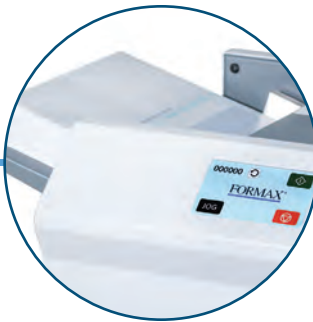
Drop-In Feeding System Dependable feeding of forms with no paper fanning required