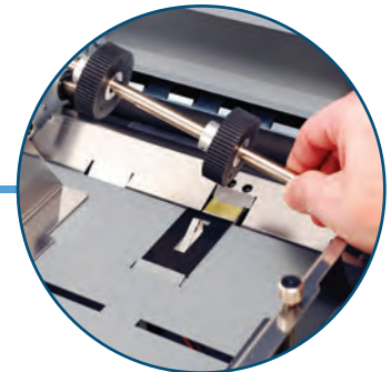
Removable Feed Wheels Easily accessible to change without removing side covers