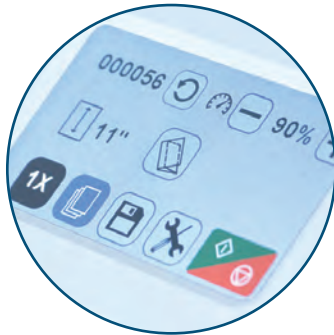
Color Touchscreen Control Panel Graphics-based and designed for easy, walk-up use

The AutoSeal® FD 2056 is a fully automatic high-volume tabletop pressure sealer, which can process forms at up to 16,450 per hour . Stand-out features include a color touchscreen control panel , drop-in feed system , and an integrated telescoping conveyor which extends to hold up to 500 forms. The FD 2056 automatically senses and adjusts for form sizes including 11", 14" and 17", and the AutoStack™ wheels automatically adjust for neat, sequential stacking. It features 5 pre-set standard folds and the ability to store up to 35 custom fold settings . The advanced software allows for all standard fold types and form sizes to be customized. Options include the V-Stack36i which vertically stacks up to 22" of processed forms for easy unloading. Proudly made in the USA , the FD 2056 is an ideal high-volume solution for pressure-sensitive mailers.