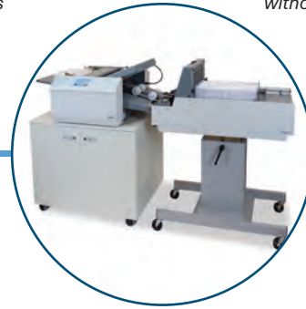
Optional V-Stack36i Stacker Vertically stacks up to 22" of folded documents, for easy unloading