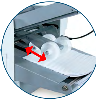
AutoStack™ Stacker Wheels Fully automated to adjust for various form sizes