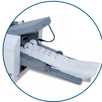
Integrated Telescoping Conveyor Extends from 14" to 36" in length and holds up to 500 folded pieces