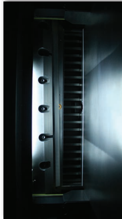
THE FACE OF A CHAMPION

Purchasers of new Champion paper cutters have been rewarded years later with excellent resale value. Champions hold their value making them one of the most sought-after cutters in the used equipment market.