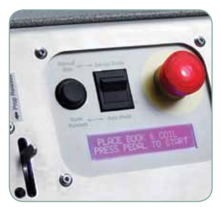
LCD Screen communicates machine status at all times.