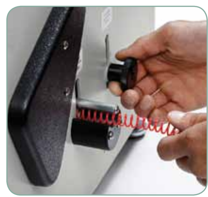
Change from size to size with the innovative diameter adjustment guide