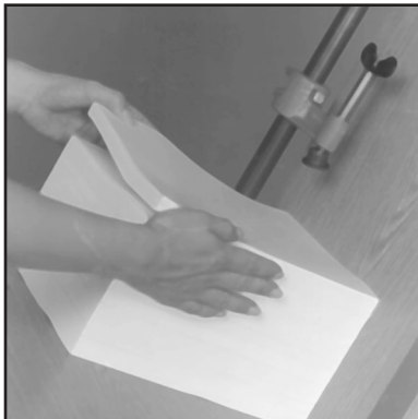
1-Tilt & Load

Turn your padding operation from messy inconvenience to high-capacity profit center with simple 1-2-3 operation