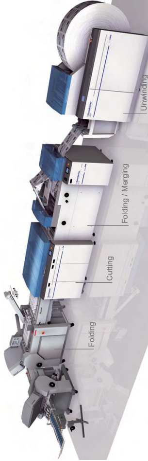
AF-566F Digital (Right angle 6+4 buckles) + Hunkeler sheet processing system

Easy operation and advanced technology increase the possibility of in-line finishing with surprisingly simple changeovers and application flexibility.