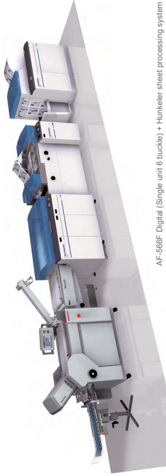
AF-566F Digital (Single unit 6 buckle) + Hunkeler sheet processing system