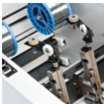
Magnetic stitching heads feature "one-step" threading for quick and easy set-up.