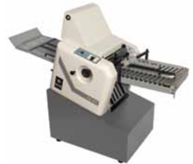
714XLT 8-Page, alone