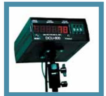
Baum Batch Counter

The Baum Batch Counter provides a vacuum interrupt to create a gap between batches on air feed models. A lift-wheel interrupt model is available for either air or friction feed models.