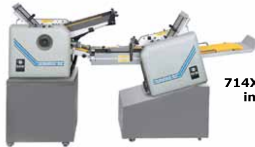
714XLT 8-Page, in tandem

The 714XLT includes a helpful folding chart [domestic or metric] on the delivery tray that shows seven types of folds: Single fold, Letter fold, Fan fold, French fold, Double-parallel fold, Double-letter fold and Engineering fold, with a few simple settings.