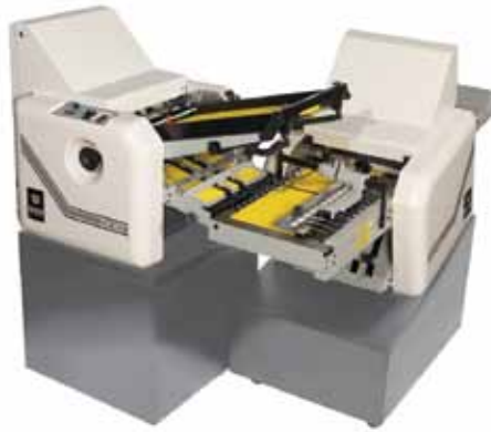
714XLT 8-Page, right-angle

The 714XLT Right Angle features more effective stack removal for higher productivity, new positive drive cross-carrier design, and "up & down" folding position capability.