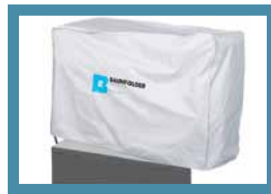
714XLT Dust Cover

The dust cover protects your machine from paper dust and other environmental factors.