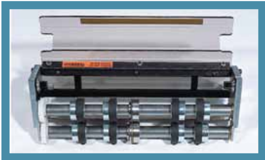
Ultracore Perf Score Attachment