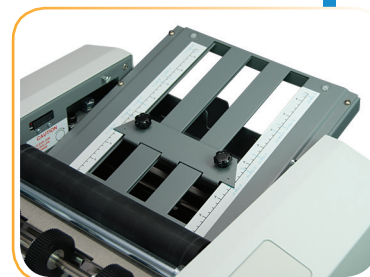
Redesigned fold plates - Clearly marked and easier to adjust