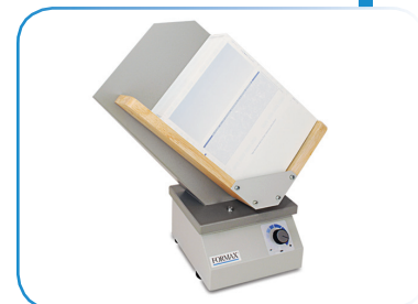
402 Series Jogger - an option which reduces static electricity from forms and aligns them for proper feeding