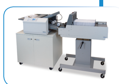
FD 2054 in-line with optional V-Stack36 Vertical Stacker, stand and cabinet

Formax - New Hampshire, USA www.formax.com