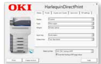
Harlequin MultiRIP 10