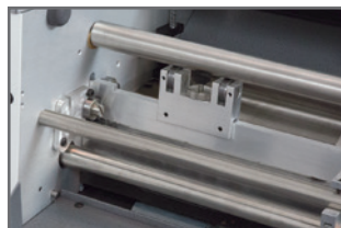
CAM Actuated Compression Creasing