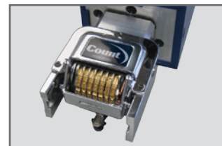
Numbering Head Wheel With Font Style Gothic (7)