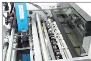
Strike Perforating Head

One easy-to-use machine to meet all your numbering, creasing and perforating needs.