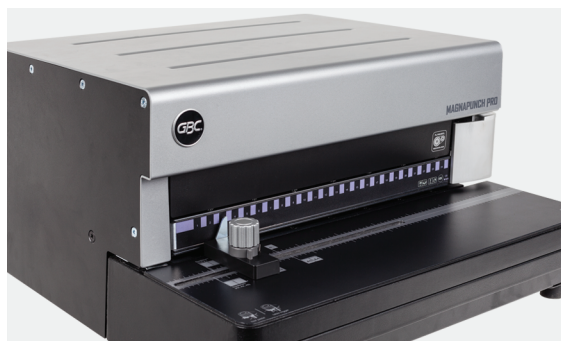
Redesigned metal cover