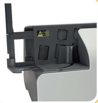
Easy-to-use support arm extends to hold large envelopes