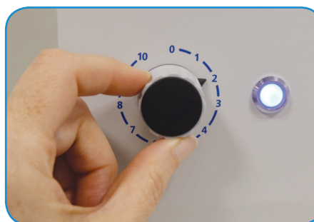
Variable speed control knob