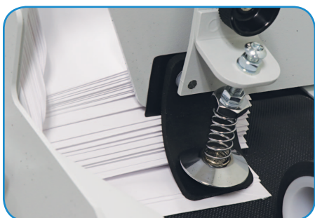
Envelope separator ensures single feeding

Options: FD 430-10 Extended Sealing Kit for flaps up to 4" long, FD 430-20 Square Flap Moistening Basin and Roller