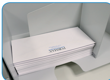
Adjustable outfeed tray accommodates a wide variety of envelope sizes, keeping them neatly stacked after sealing