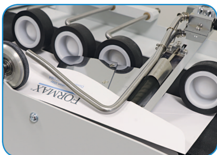
Precision moistening roller and flap closing bar accurately seal stacked or nested envelopes in a single pass