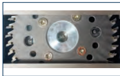
HEAVY DUTY NOTCHING

The clamp adjusts automatically between two sheets and 2 inches. Both the clamp and nipper are pneumatic, run by the supplied silent compressor.