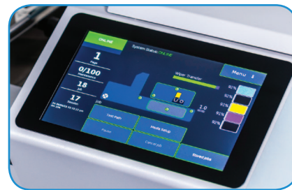
Intuitive 7" color touchscreen displays system status, image preview, and provides access to stored jobs