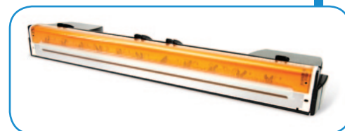
Memjet® print head has 70,400 ink nozzles for higher speeds, lower ink use and less noise than standard print heads