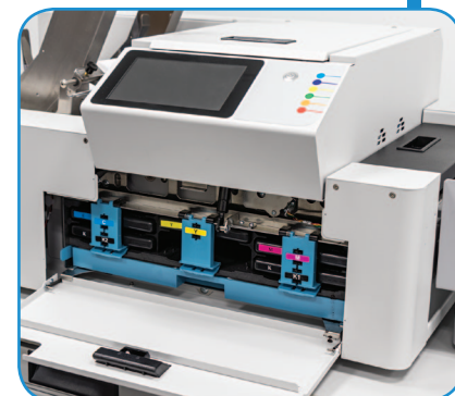
Clamsell design offers easy front access to ink tanks and paper path