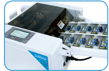
Automatic friction feed system and interlocking plexi cover