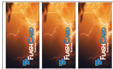
3-up 4.25" x 8" postcards Optional FC-20 - 8" Cassette