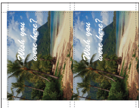
2-up 5" x 7" postcards Optional FC-10 - 7" Cassette