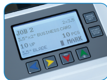
User-friendly LCD control panel