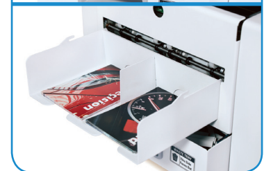
Adjustable catch tray keeps cards neatly stacked