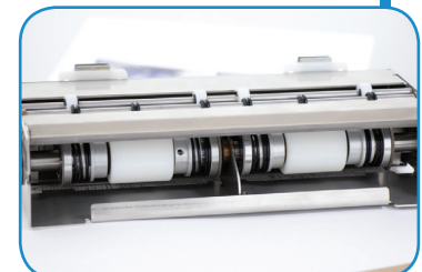
Heavy-duty cutting cassettes are interchangeable in seconds