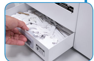
Waste bin collects paper scraps and is easy to empty