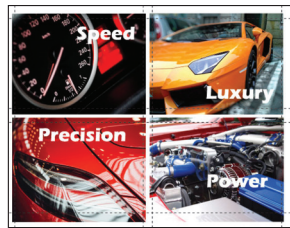
4-up 3.5" x 5" postcards Standard FC-05 - 3.5" Cassette