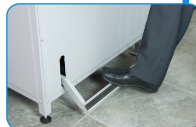
Foot pedal pre-clamp holds paper to check alignment prior to cutting