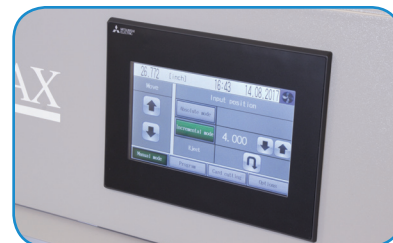
Touchscreen control panel allows for programming up to 100 jobs