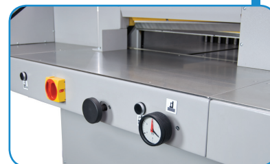
Two-button operation, fine-tune knob, adjustable hydraulic pressure gauge