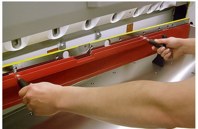
Blade changes are safe, quick and easy. This image shows the blade mounted in the protective guard after it was lowered by the knife hoist.

Low pressure device (for corrugated and pressure sensitive material)