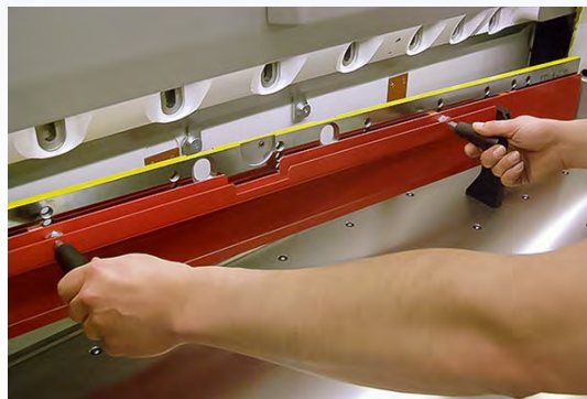
Blade changes are safe, quick and easy. This image shows the blade mounted in the protective guard after it was lowered by the knife hoist.

S2C package (Straight To Cut), with bar code scanner and CIP3/4 network connectivity