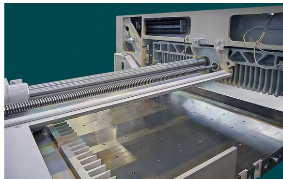
The backgauge is rigidly-mounted from above so there is no need for a slot in the table which permits smooth sliding of stacks. No table slot belt to get caught on like on other brands.