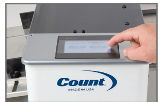
Touch Screen Controller

The COUNT™ iCrease Pro + is a robust solution for creasing and perforating digital media to eliminate cracking when folding. Get the automation of bigger COUNT machines in a simple hand-feed machine anyone can use. The iCrease Pro + can crease and perf in one pass (no need to refeed!), with multiple crease locations and perfect bind covers, with choice of automatic hinge placement or no hinge.