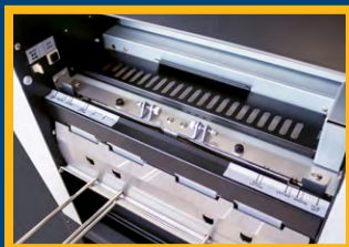
Simple-slide paper size adjustment