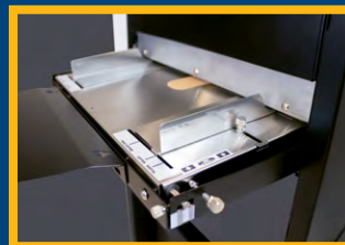
Upgraded multi-thick- ness feed tray