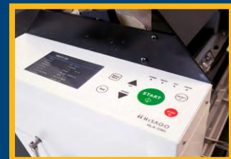
Easy-to-use Color Screen & Controls