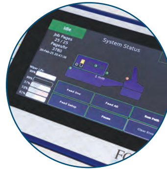
Touchscreen Control Panel For centralized operation and easy adjustments