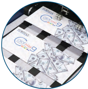
Processes up to 10,000 #10 envelopes per hour: Production speeds in a robust tabletop printer