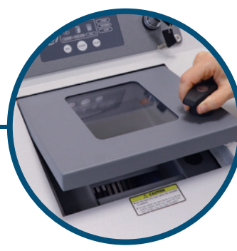
Enclosed Shredding Chamber Plexiglas cover allows for safe viewing of game piece destruction