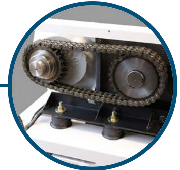
Chain-Driven AC-Geared Motor Can shred 3 decks of cards, 20 dice, or 40 casino chips per cycle