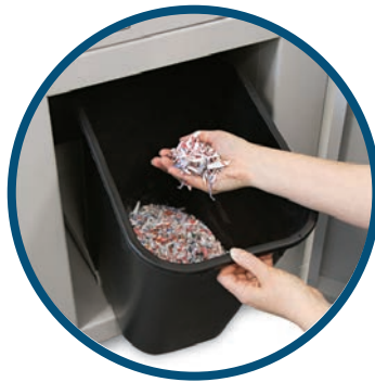
Front-Access Waste Bin Shredder can be placed against a wall to save space