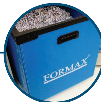
Durable Waste Bin Lifetime guaranteed rugged molded plastic for durability