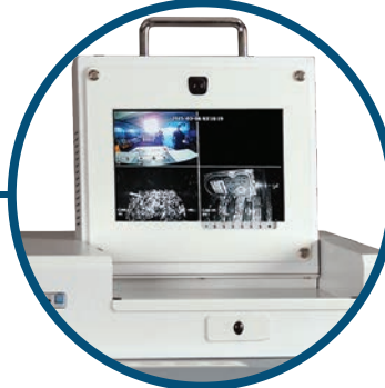
Camera Monitoring System Four camera angles provide live monitoring and recording