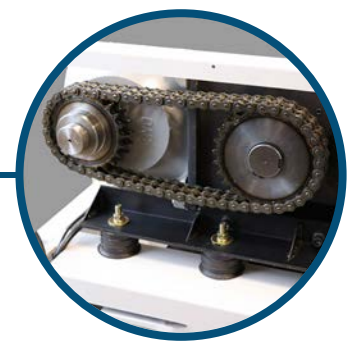
Rugged Chain-Driven Motor 3HP motor powers through cards, dice, casino chips, and tokens