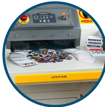
Conveyor Feeding System Allows for shredding up to 650 lbs of playing cards per hour