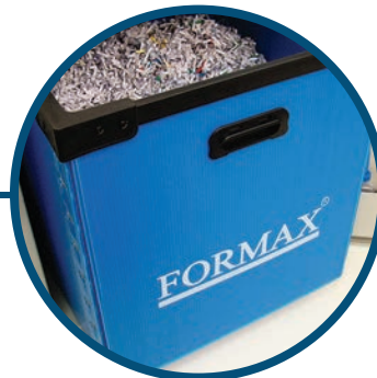
Durable Waste Bin Lifetime guaranteed rugged molded plastic for durability