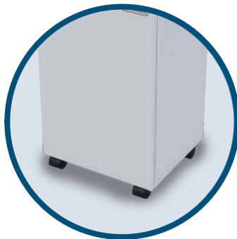
Rugged All-Metal Cabinet Includes casters for mobility