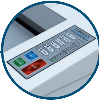
Easy-to-Use Control Panel Auto, Reverse, Bin Full Indicator, Load Indicator, ECO Mode