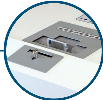
3 Dedicated Infeed Options: Safely feed various size media through the appropriate infeed, up to 6.5" W