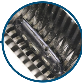
Commercial Grade: Solid-steel heat-treated blades and rugged chain-driven motor