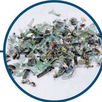
Media Shredding: Shreds media into random pieces up to 0.60". Perfect for security and peace of mind