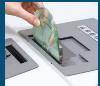
CDs and DVDs