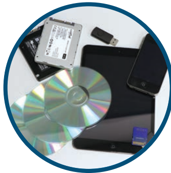
Multimedia Devices: Easily shreds a variety of media from mobile phones to mini tablets