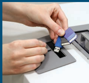
USBs and SD Cards