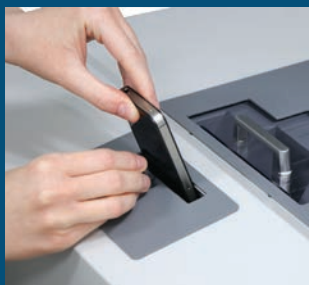
Mobile Phones and SSDs