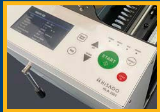
Easy-to-use color screen & controls