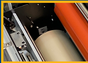
EverStick film applies settings for you