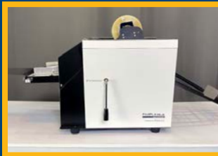
Convenient desktop design