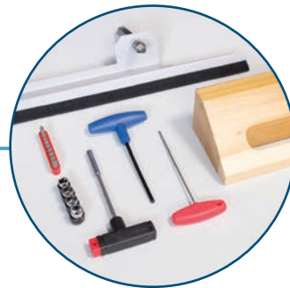
Blade Change Safety Tool Kit Change blade safely and easily, and make adjustments