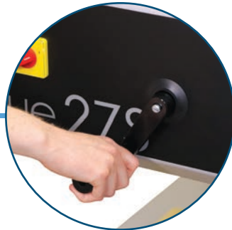
Spindle Guided Back Gauge Allows for fine adjustments in both inches and metric with LED display