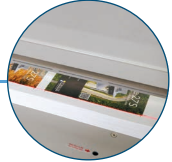
LED Laser Cut Line Shows where the blade will cut to make fine adjustments