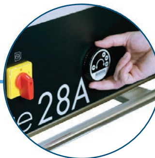
Electronic Back Gauge Adjustment Fine-tune control for precision cutting