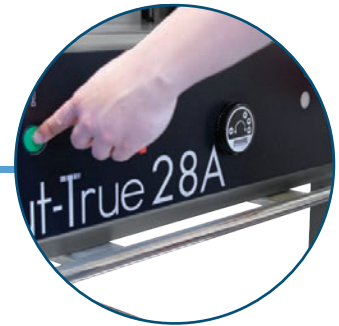
Two-Hand Operation Automatically engages clamp and blade, keeping hands away from the cutting area