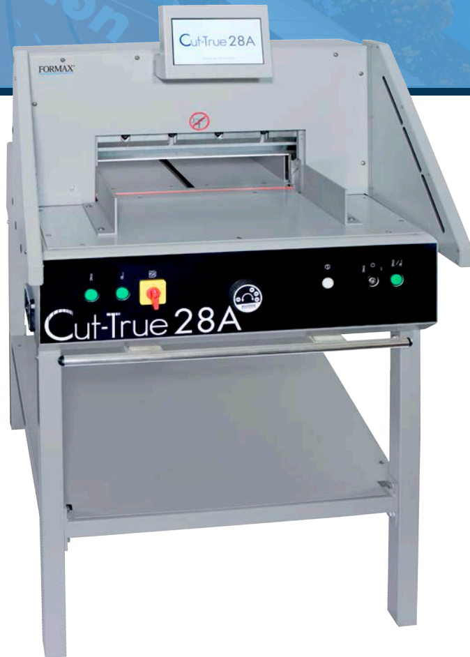
Rugged metal stand with integrated storage shelf included