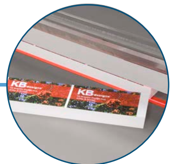
Crisp, accurate cuts High-quality hardened steel blade for razor sharp cuts, time after time