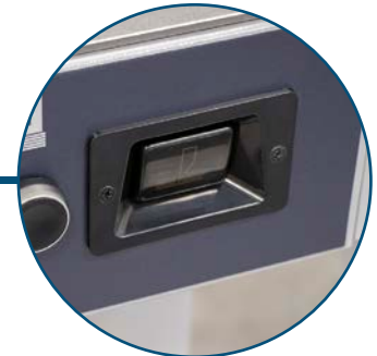
User-Friendly Design Ergonomically designed buttons for long-term operator comfort