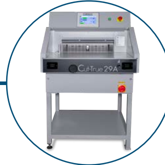
Standard Model Shown without side tables