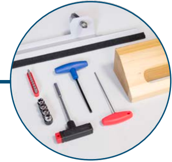
Blade Change Safety Tool Kit Change blades safely and easily, and make adjustments