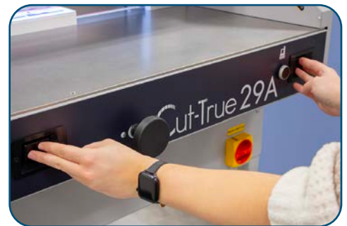
Two-Hand Operation for Safety Automatically engages clamp and blade, keeping hands away from the cutting area