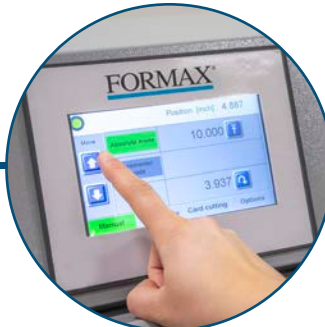
Touchscreen Control Panel Program jobs, switch between inches/mm, paper eject function, programming via cutting & more