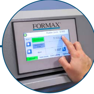
Touchscreen Control Panel Allows for programming up to 100 jobs and 100 steps