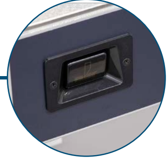
User-Friendly Design Ergonomically designed buttons for long-term operator comfort