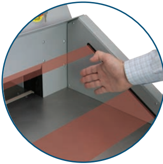
Infrared Light Beam Safety Curtain Immediately stops operation if the beam is interrupted

The Formax Cut-True 29H Hydraulic Guillotine Paper Cutter is designed for true two-shift operation and offers precision cutting for paper stacks up to 20.5" wide. User-friendly, intuitive features include a 7" full-color touchscreen control panel , automatically-adjusting back gauge and the capacity to program up to 100 jobs/100 cuts . An infrared light beam safety curtain provides safety and convenience as it shuts down operation if the light plane is interrupted. It's ideal for transforming large sheets into brochures, invitations and more, and is a welcome addition to print shops and in-plant finishing operations.