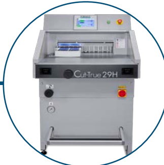
Standard Model Compact model without optional side tables