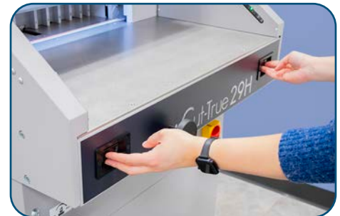
Two-Hand Operation for Safety Automatically engages clamp and blade, keeping hands away from the cutting area