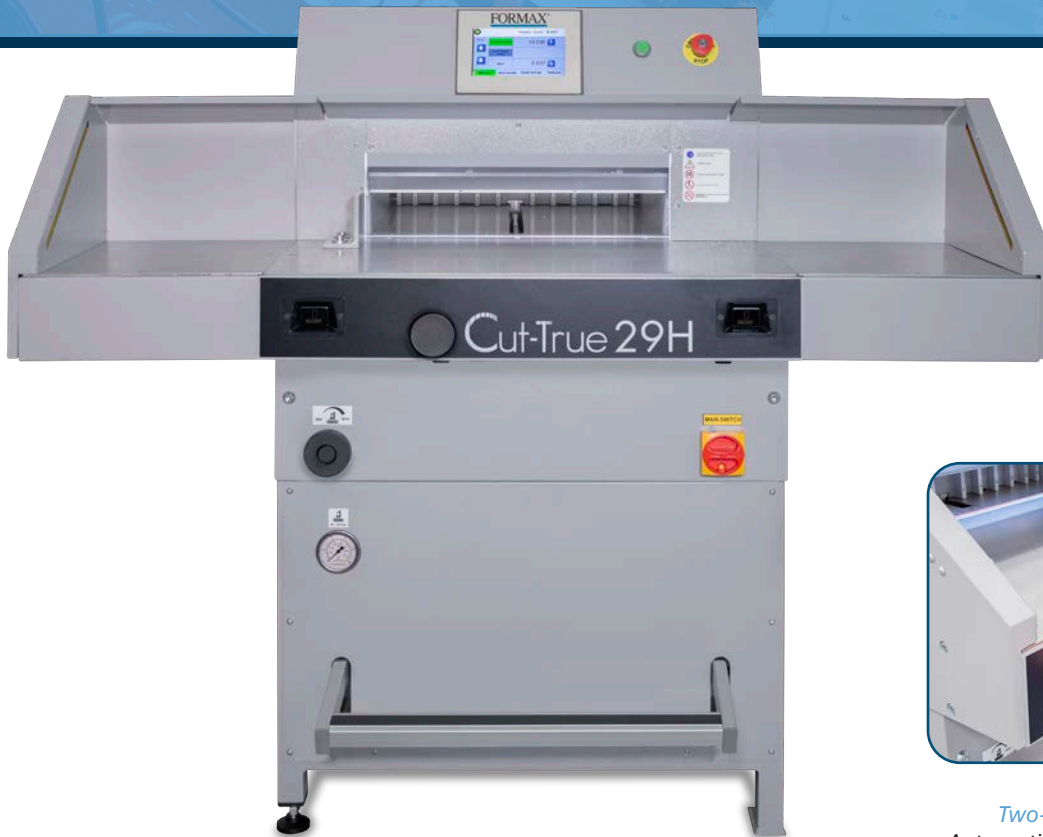
Shown with optional wide side tables