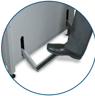
Foot Pedal Pre-Clamp Holds paper to check alignment prior to cutting