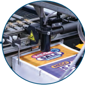
Top-Feed Suction System Delivers precise, high-speed feeding for consistent throughput