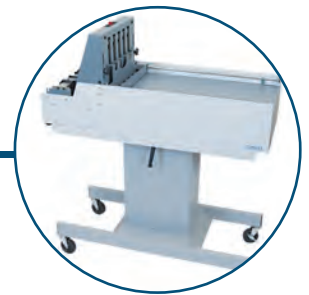
Optional V-Stack36i Stacker Vertically stacks up to 22" of folded documents for easy unloading