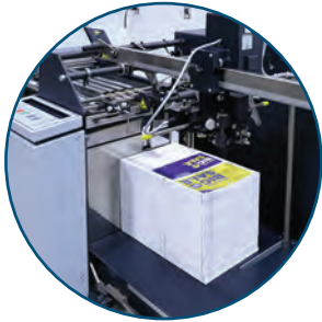
High-Capacity Pile Feeder High-capacity elevating deck holds up to 3,500 forms

The AutoSeal® 2150 Series Production Pressure Sealer is designed to process high-volume jobs up to 27,000 forms per hour, with an unlimited monthly duty cycle . The graphics-based 12" color touchscreen is mounted on a swivel arm , and provides intuitive control of fold type, form length and operating speed. Users can program up to 200 custom jobs , and process forms up to 17" wide and 26" long . Two configurations are available, each with a pile feeder input: the FD 2150 with 2 automatic fold plates, and the FD 2156 with 6 automatic fold plates. Fully automated settings include the feeder, transport deck, fold plate stops, deflectors and fold rollers. Standard features include heavy-duty fold plates, steel-and-urethane fold rollers, safety interlocks, jam detection, and addition/batch counter . Options include the V-Stack36i Vertical Stacker.