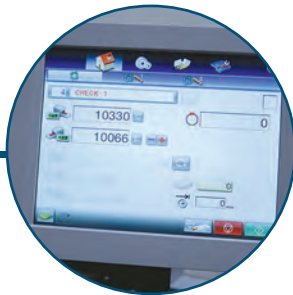
12-inch Color Touchscreen Graphics-based and designed for easy walk-up use