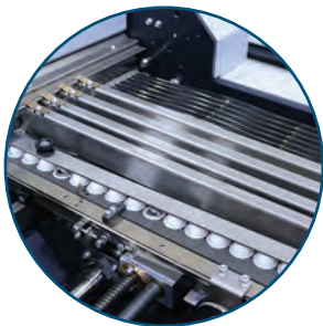
Auto-Adjust Transport Deck Automatically adapts to different form widths